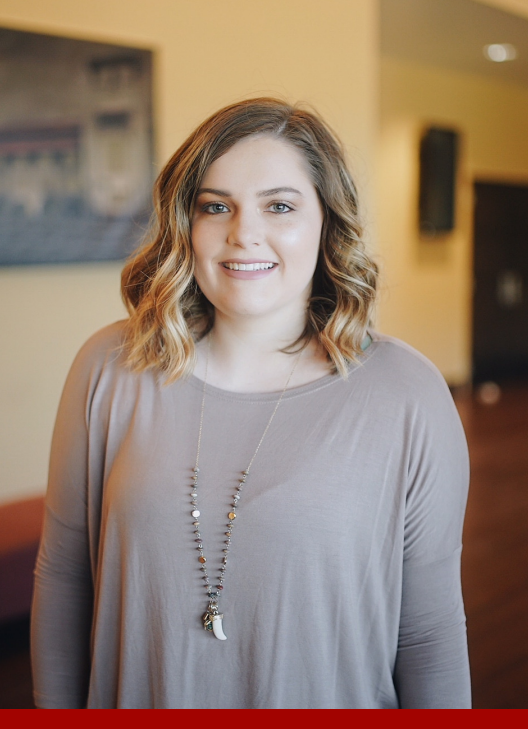
Parker Heil College Panhellenic Council (CPC)