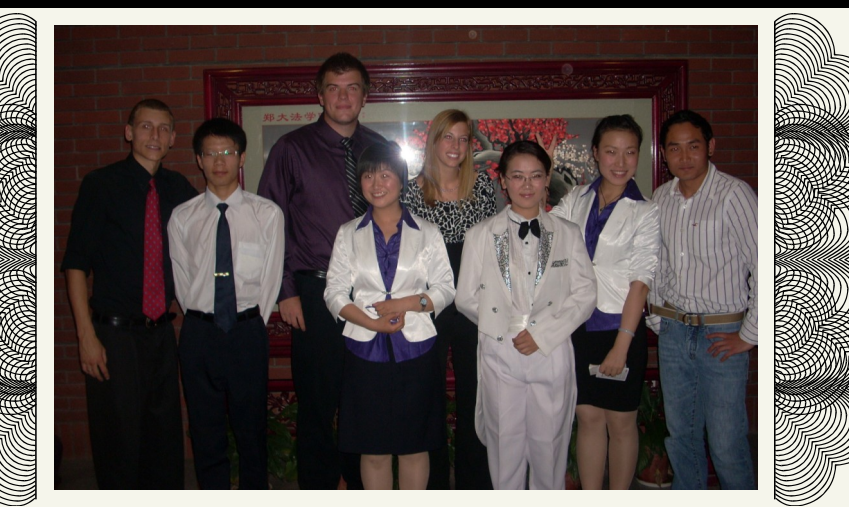
American and Chinese Debaters Unite

"This debate was one of my most challenging, unexpected, and fulfilling coaching experiences. The efforts of all five USG debaters made it that way, and that over 20 years of coaching, I had never seen so much learned in the course of five days. Coaching the debate was the last thing I had planned to do on the study abroad, but it ended up being one of my most excellent experiences, thanks mainly to the students involved. A framed picture of all the debaters from both teams is still displayed prominently in my office."