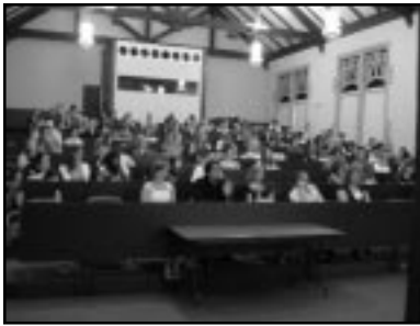
record attendance for fall convocation