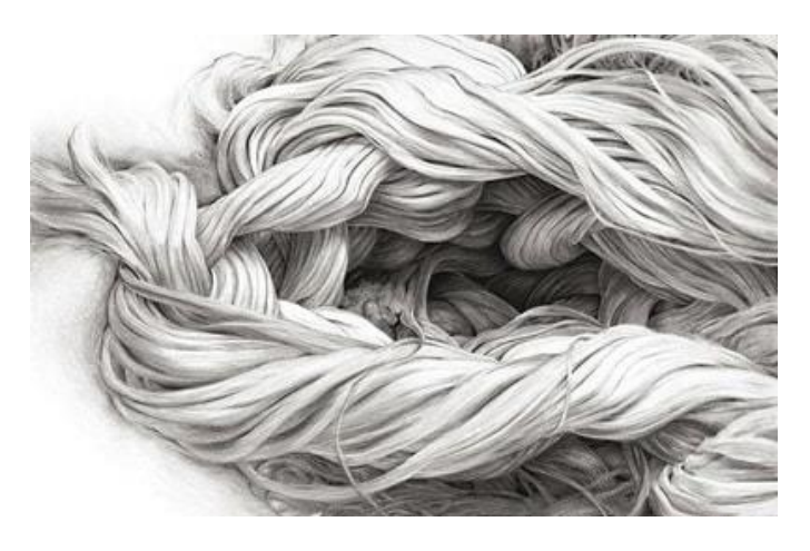
White thread, charcoal on paper, 24 x18 inches Student Work

When finished your drawing must exhibit a believable rendering of your still life on one piece of 18" x 24" drawing paper with a full value representation of a textured object using compressed & vine charcoal, charcoal pencil, black chalk pastel, white chalk pastel, and eraser. The composition must be well thought out, unique, and balanced.