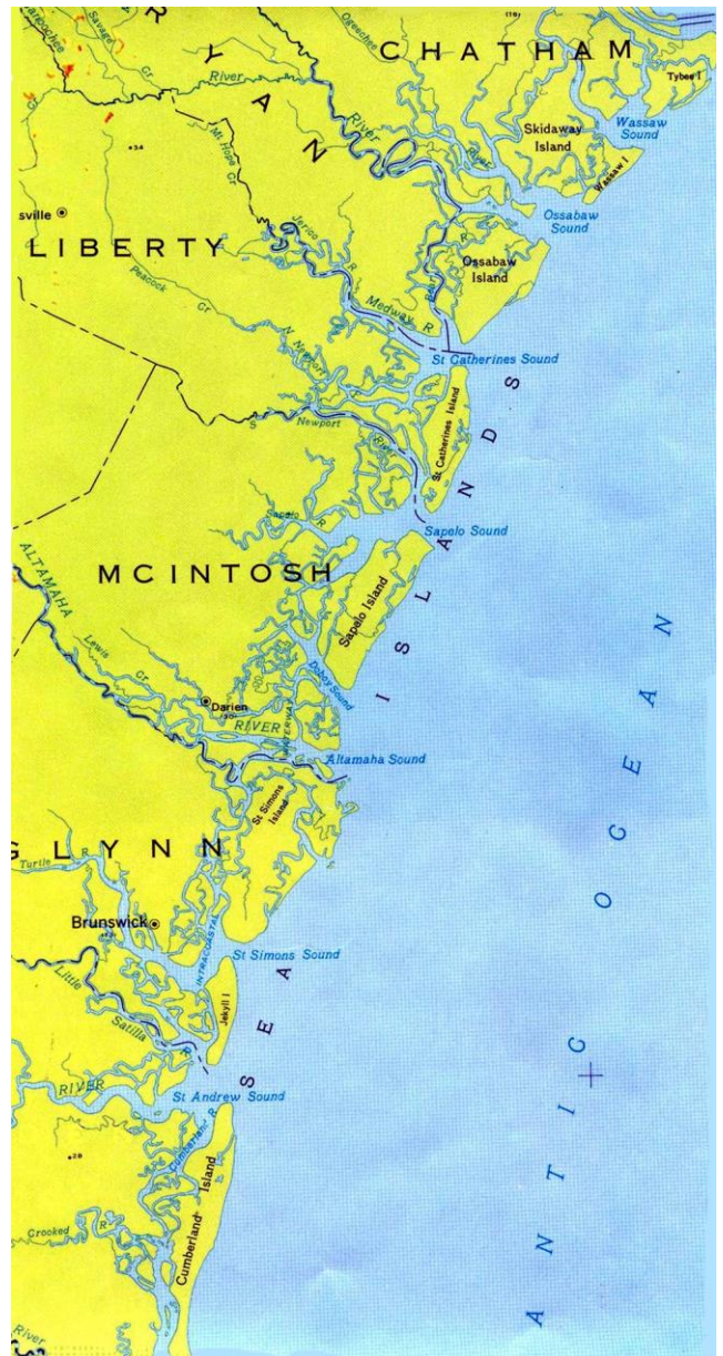
Georgia's Coastal Barrier Islands

Graduate credit. At the beginning of the semester, graduate students should discuss with the instructor additional course requirements for graduate credit.