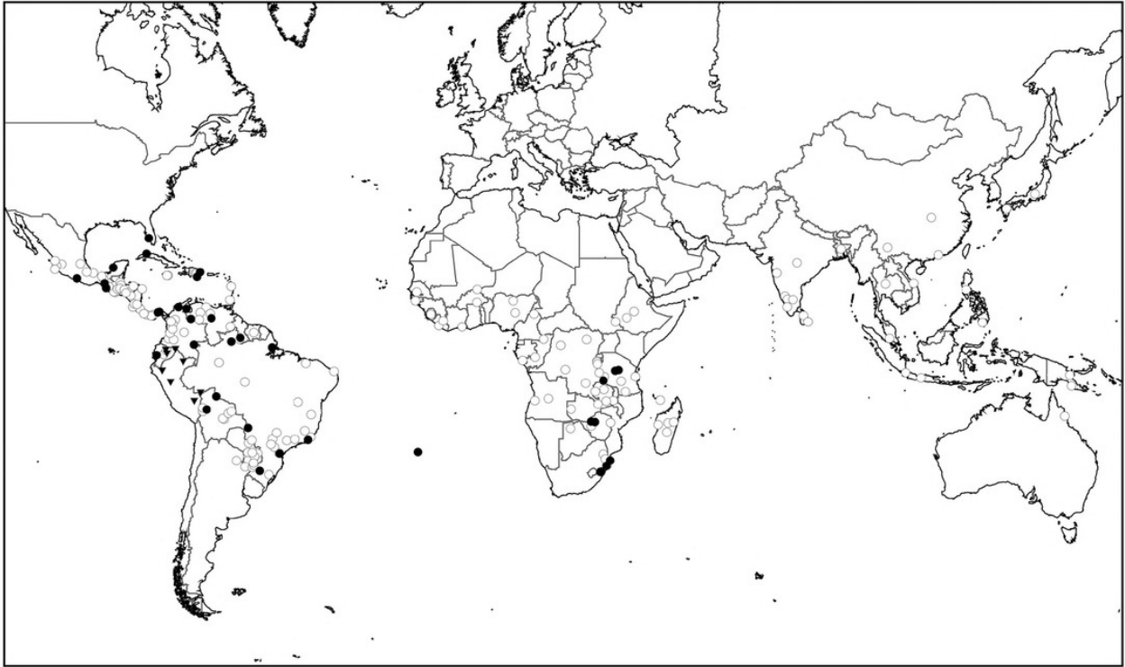
Fig. 2. Distribution of Eleocharis acutangula subsp. acutangula (open circles), E. acutangula subsp. breviseta (closed circles), and E. acutangula subsp. neotropica (triangles). Each symbol represents one or more specimens.