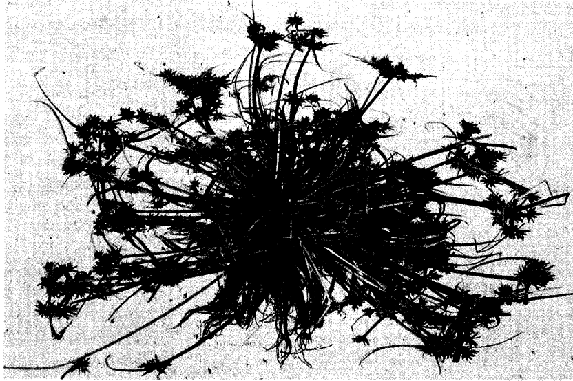
FIG 2. Photograph of Cyperus fuscus taken from Lisbon Bottoms, Big Muddy National Fish and Wildlife Refuge, Howard Co., Missouri, 11 Oct 1997.