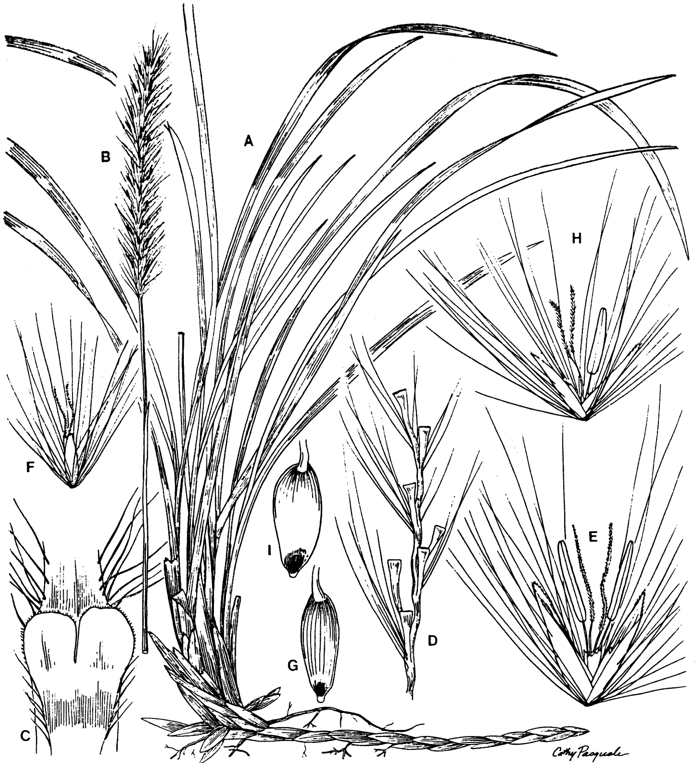
Figure 1. Illustration of Imperata cylindrica (A-G) and I. braziliensis (H-I). A. Habit of I. cylindrica ; B. Panicle and culm of I. cylindrica ; C. Sheath of I. cylindrica ; D. Panicle of I. cylindrica ; E. Flowering spikelet of I. cylindrica ; F. Fruiting spikelet of I. cylindrica ; G. Caryopsis of I. cylindrica ; H. Flowering spikelet of I. braziliensis ; I. Caryopsis of I. braziliensis .