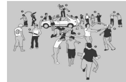
Zombies, for example