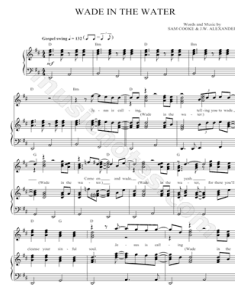
Big Mama Thornton