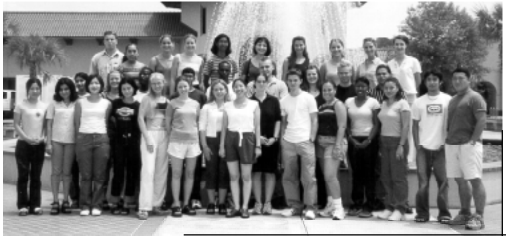
Today, 212 international students attend VSU, representing 58 countries.

g reetings from Valdosta! And welcome to the fifth edition of the VSU International Alumni Newsletter. Valdosta State University enrolled its first international student over thirty years ago. Today, two hundred twelve international students attend VSU, representing fifty eight countries. The Center for International Programs has designed this newsletter as a way to share with you campus news and information about the lives of international students who completed all or part of their studies at VSU.