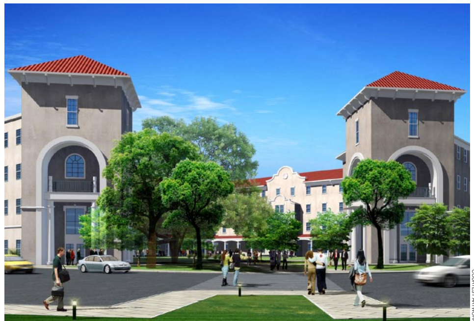
Hopper Hall Street Perspective Rendering

Construction will improve many aspects of student life. Approval was granted for Hopper and Georgia halls to be demolished and rebuilt into stylish, efficient living/learning communities and Reade Hall to be renovated to update the historic structural elements and expand common areas for students. Two parking decks will be constructed, one in Oak Street parking lot and the other in the Sustella lot behind the Student Recreation Center, to address the increasing need for student parking, while a new, highly technical student health facility will address the healthcare needs of VSU's increasing student enrollment. Finally, the existing University Union will be replaced