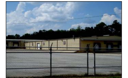
Crown Laundry Services

Crown also has existing facilities around the Southeast, including Selma, Alabama, Pensacola, Florida and Columbia, South Carolina. The Quitman, Georgia facility is to be the newest addition in Crown's 49 year history of customer service.