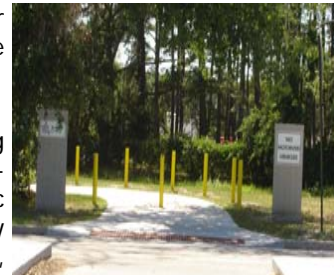
The Azalea Trail completed in 2005 is a multipurpose trail that provides access between the Craig Center, Drexel Park at VSU and the Vallotton Park Recreation Facility.

As part of the transportation planning activities carried out through the Metropolitan Planning Organization (MPO), the South Georgia RDC has hired a consultant to develop the first ever Bicycle & Pedestrian Plan for Valdosta/Lowndes County. This master plan will provide an overview of the transportation needs within our metro area and examine existing facilities for these modes of transportation as well as future amenities to enhance safe interconnectivity between our parks, schools, and community activity centers. The plan will promote healthier lifestyles and alternatives that can be integrated with our roadway network.