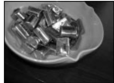
chocolate = fuel

either updating the VSU Honors Program website or producing the next issue of the Honora , like the one you are reading now. I'm in my second year at Valdosta State University, majoring in English and pursuing a minor in art aspiring to be a magazine editor. So that's my mini-bio; I just want to welcome you all to the Honors Program. I'm sure I'll see you around.