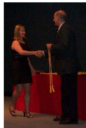
Honors Program Spring Recognition Ceremony: April 18, 2005