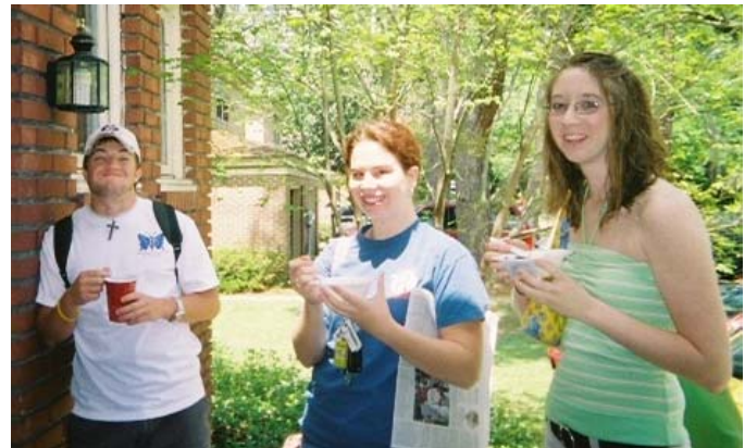
Honors students enjoying Homemade ice-cream at our Ice Cream Social.

other activities, Honors Program students found many ways to serve the community and enjoy each other's company in 2004-2005.