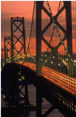
Plan for your future today! Apply for an Internship.

For access to additional internship opportunities and resources maintained in the Career Center, schedule an appointment to speak with a Cooperative Ed/Internship Coordinator at (229) 333-7172