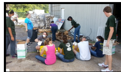
Students repackaged bathroom fixtures.