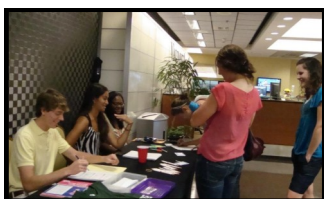
HSA officers sign in new freshman