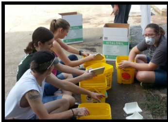
Our volunteers were hard at work!