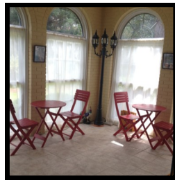
The Café's interior