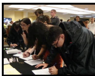
Honors freshmen are excited to join HSA.