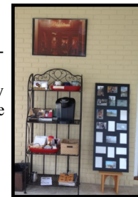
The coffee station.

Honors College aims to foster that same atmosphere to encourage students to think outside the box. Many thanks to all who have donated supplies. Be sure to stop by and enjoy a nice cup of joe!