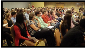
The record-setting crowd listens attentively to the speakers.

On August 21, a record number of over 175 people attended the annual Honors Convocation.