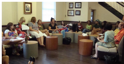
Honors students enjoyed the lively discussions!