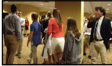
Students enjoy the free refreshments.