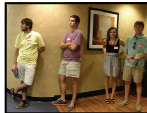
Mentors prepare to meet their mentees.

All of the groups did a fantastic job and put tremendous amounts of effort into the projects. We are very excited for the new year with all these new faces!