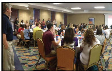
Students eagerly await for the Colloquium to start.