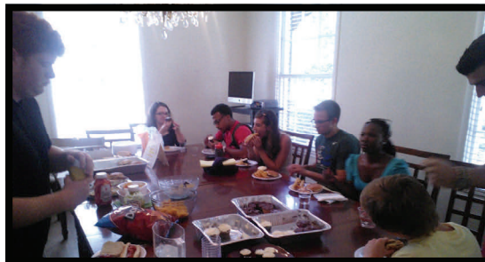
Students enjoy the free food provided by the Honors College.

Thanks to everyone who attended and contributed food. The Honors College hopes to hold more lunches in the future.