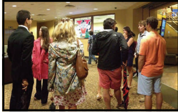
Students and faculty mingle after the Convocation.

“The balance of success and achievement is something we are all concerned with, but success is more than grades...Success and fulfillment comes from