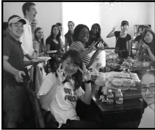
Students pose around the food for a fun picture!

The students enjoyed hamburgers, veggie burgers, cookies and a variety of chips. When they were not eating, students spent time getting to know each other and developing cross-cultural relationships.