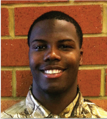
University of Georgia