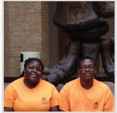
Students at Fernbank Science Museum in Atlanta, GA June 21, 2013