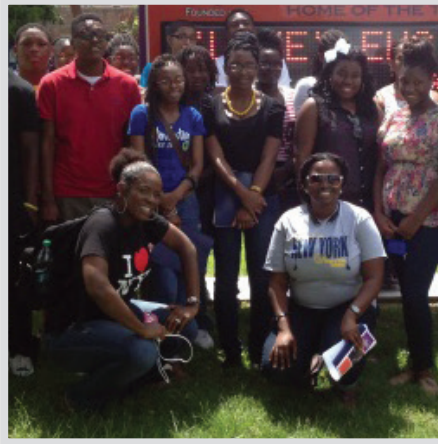
Brooks County & Valdosta High Students at Edward Waters College July 8, 2013