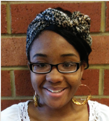
South Georgia State College